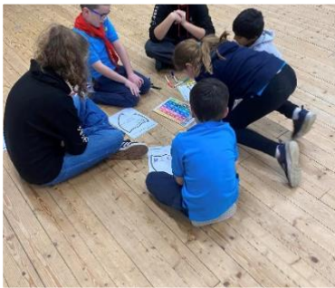
Pegasus Explorers ran the Rights Challenge Badge