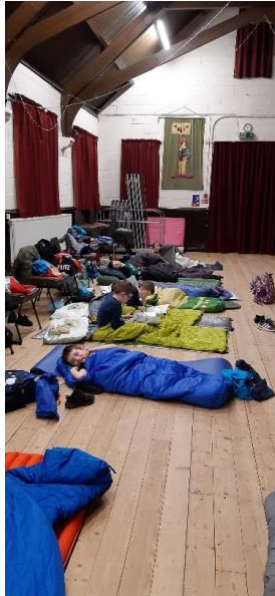
Sleepover in the hall.